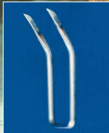
Hooks made of surface coated steel