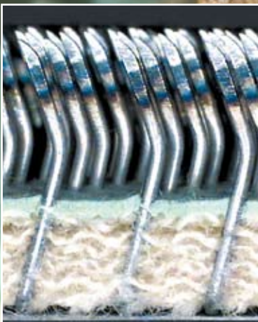
Perfect foundation structure