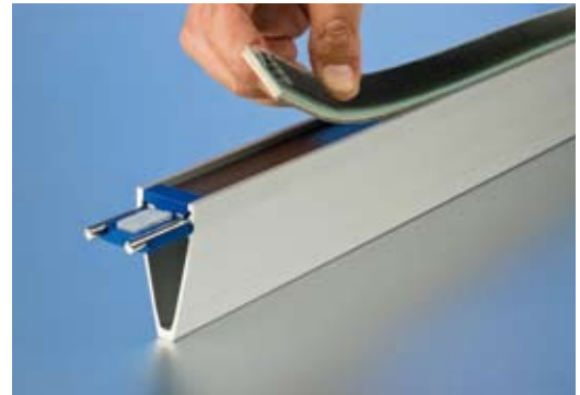
Flats clothings of the NovoTop A series are of course also available in MAGNOTOP version.

Make the most of our technological revolution and experience a new quality standard in the cotton mill.